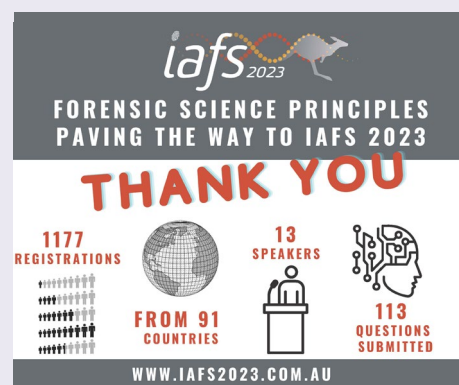
▲ The virtual event had wide forensic community engagement.

Stay up-to-date with all the latest information by joining the IAFS mailing list .